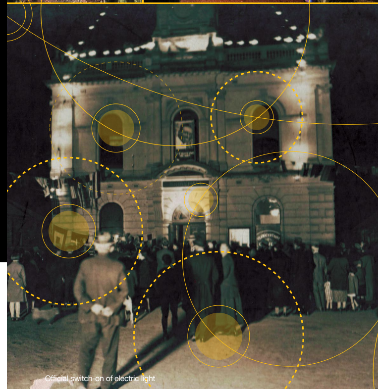
Official switch-on of electric light