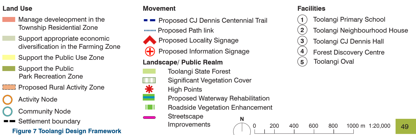
Figure 7 Toolangi Design Framework